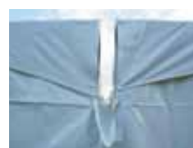
Gutter to join two marquees