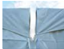
Gutter to join two marquees