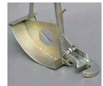
Structure Stake Puller (Hogan Stake)

Stake Pullers are a must for tent disassembling. The angled rocker and changeable Puller Jaw aid in vertical pull leverage and durability of this tool. The Stake Puller Tool has been in production and used in other parts of the world for more than 20 years. It has been finely tuned for high efficiency and will pull approximately 95% of all tent stakes in a given diameter.