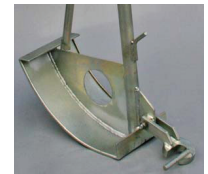
Standard Stake Puller