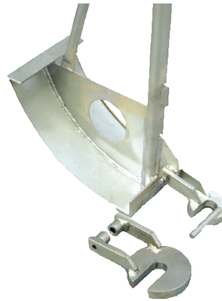
Replaceable & Interchangeable Jaw - 2 options