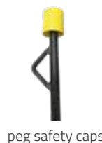
peg safety caps