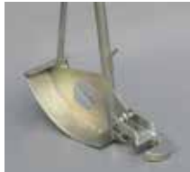
Structure Stake Puller